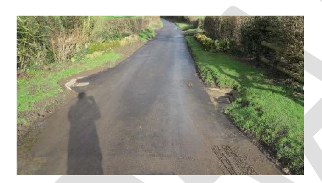
STOKE LANE YARLINGTON